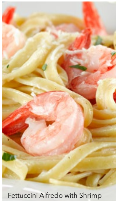
Fettuccini Alfredo with Shrimp