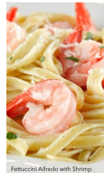
Fettuccini Alfredo with Shrimp